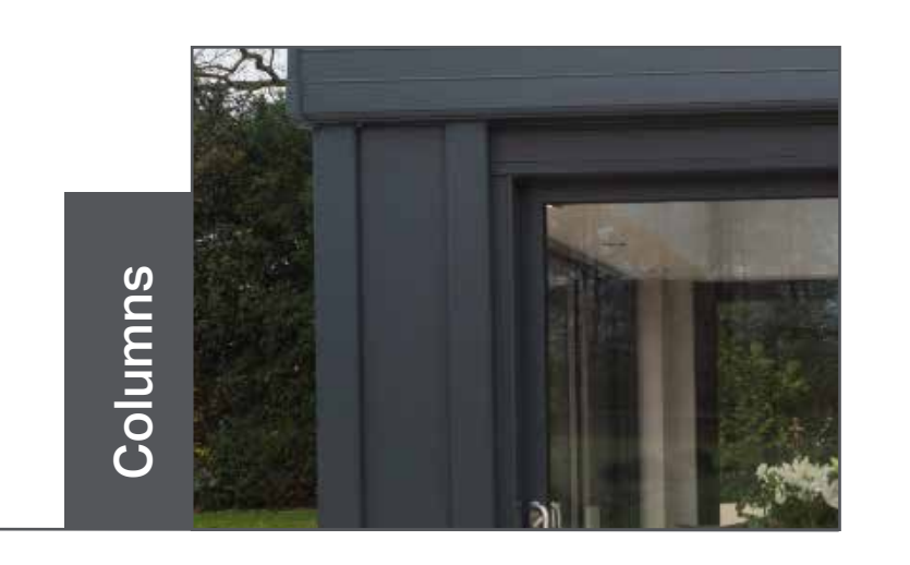
Stylish aluminium super-insulated columns add glamour and thermal performance to any orangery design