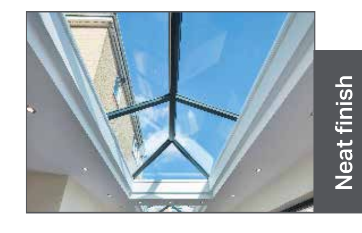
Less bars create a neat, slim lantern look from the inside