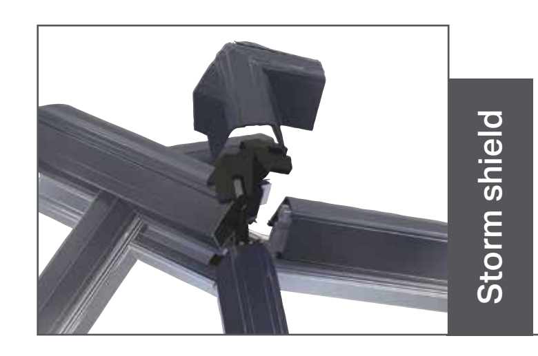
Triple layer protection at the ridge end, with glazing compression trims, a weathering shield and a secure fit cover