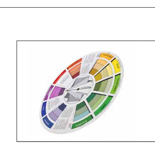
Ultrasky Lantern is available in any RAL colour to match your door and window frames